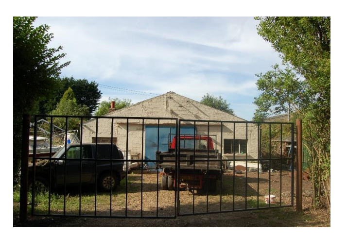
Photograph 15 Southern elevation of Building 4 looking north

Building 3 which represents the typical type of outbuilding present within the northern half of the site