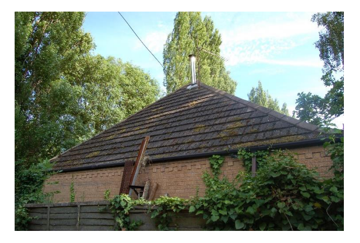
Photograph 13 Northern elevation of Building 1 looking south