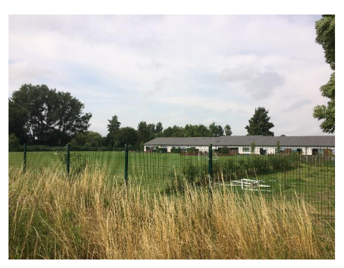
Photograph 18 Sandy Lane that bisects the northern and southern halves of the site. View looking east