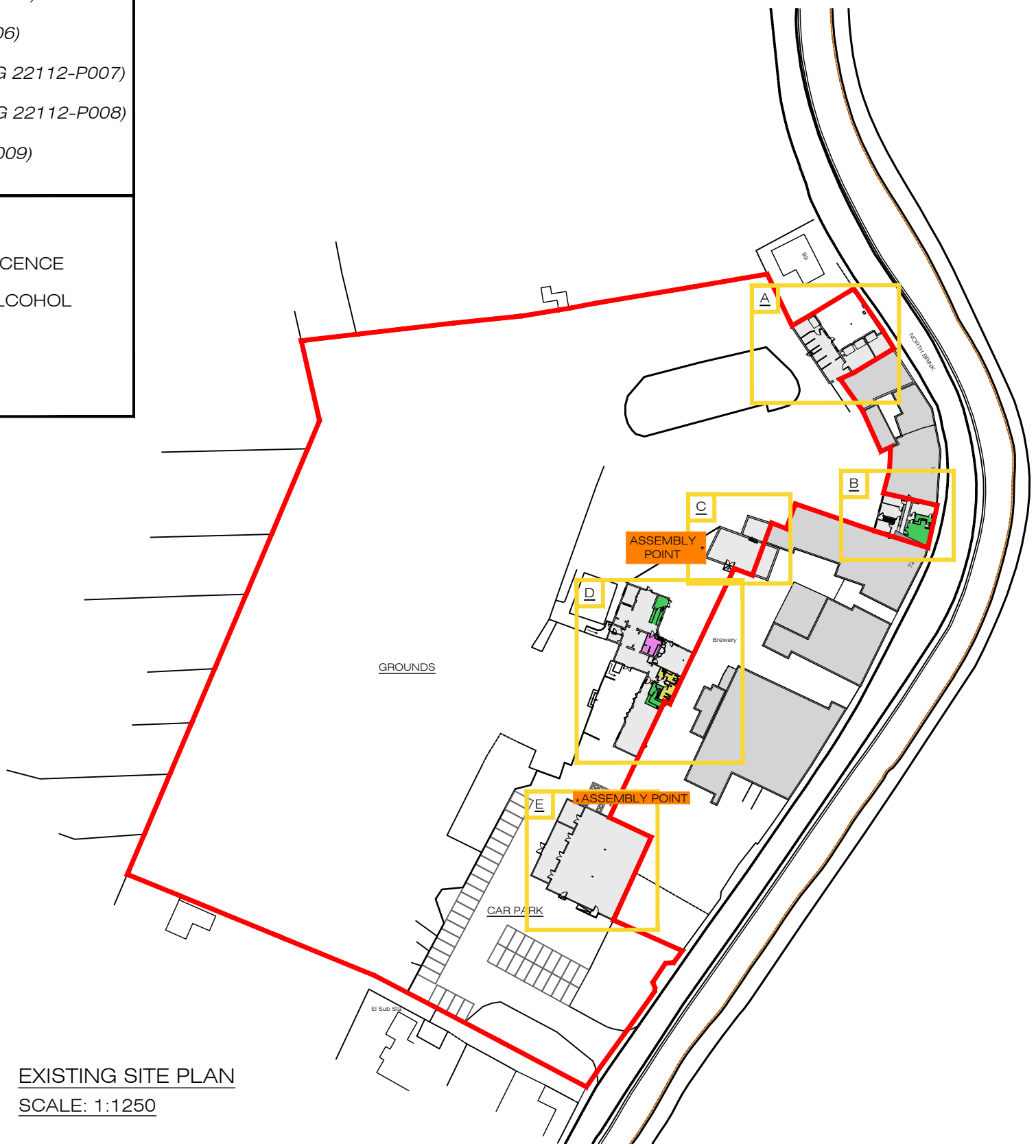
EXISTING SITE PLAN SCALE: 1:1250