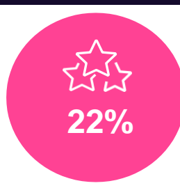
Social & Local Economic Value